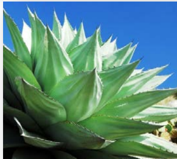
Agave ovatifolia 'Vanzie'