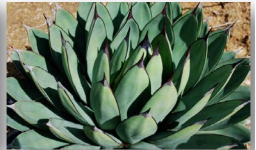
Agave 'Little Shark'