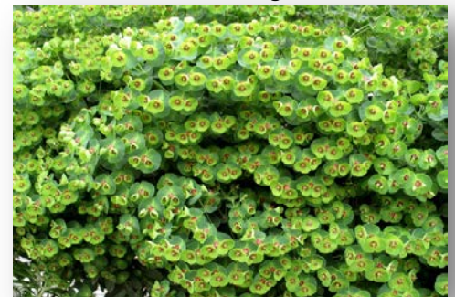
Euphorbia x martinii 'Tiny Tim'