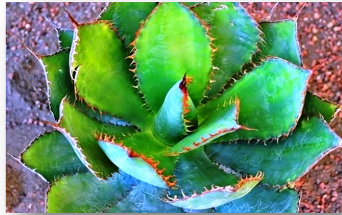
Agave bovicornuta 'Reggae Time'