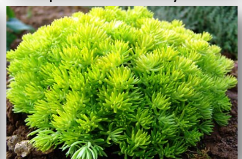
Sedum r. 'Lemon Ball'