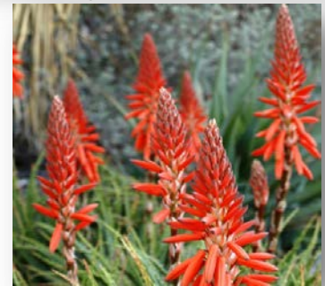
Aloe 'Always Red'