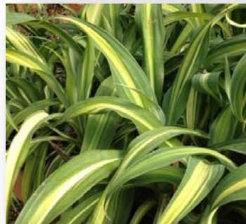
Beschorneria y. 'Flamingo Glow'