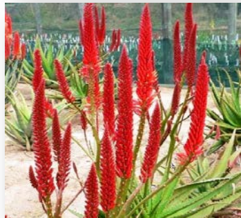
Aloe 'Erik the Red'