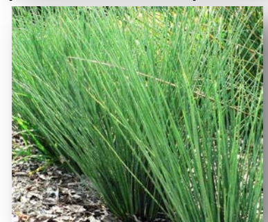
Juncus inflexus 'Blue Arrows'