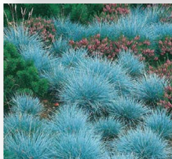
Festuca g. 'Elijah Blue'