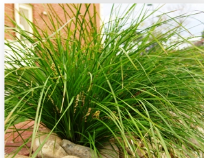
Lomandra long. 'Breeze'