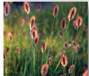
Pennisetum m. 'Red Bunny Tails'