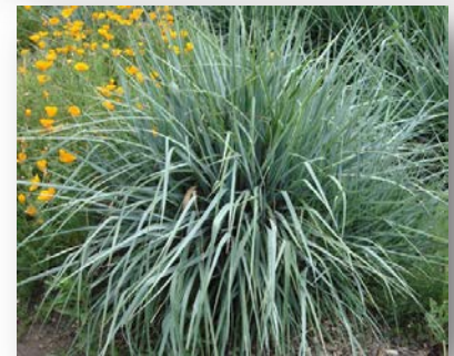
Elymus condensatus 'Canyon Prince'