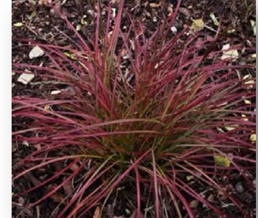
Miscanthus s. 'Little Miss'