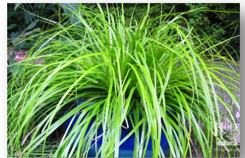
Carex o. 'Everillo'