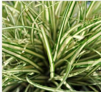
Carex h. 'Evergold'