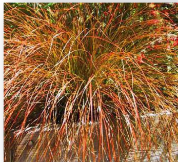
Carex testacea 'Prairie Fire'